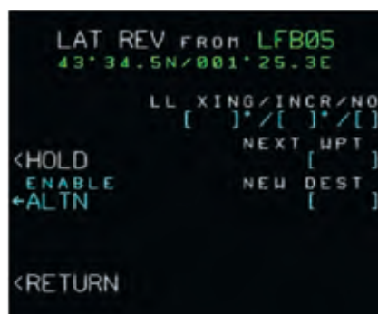
Figure 4 The missed approach remains available when discontinuing the approach. However, the FMS may have “lost” the destination